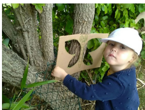
Bug Hotels in The making